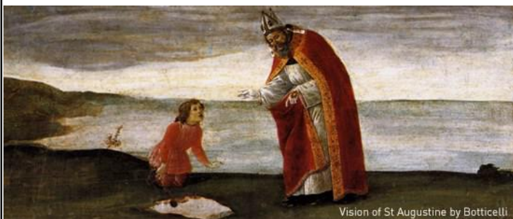
Vision of St Augustine by Botticelli

There is an ancient story about St. Augustine. "One day he took a break from writing about the Trinity to take a walk along the seashore. There he came across a child with a little pail, intently scooping up a pail full of water out of the ocean, then walking up the beach and dumping it out into the sand, then going back down to scoop out another pail of water to pour into the sand, etc. Augustine asked the child what he was doing, and the child explained that he was "emptying the sea out into the sand." When the Bishop tried to gently point out the absurd impossibility of this task, the child replied, "Ah, but I'll drain the sea before you understand the Trinity."