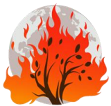
The Burning Bush Ex 3:1-12

If you would like someone to be included among these requests, please let us know by email, phone call, or by dropping a note in the locked box outside the parish office