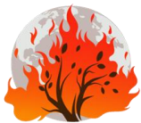
The Burning Bush Ex 3:1-2