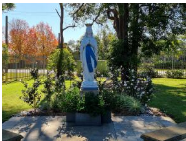
Our Garden Chapel (Located to the side of the Church) Mary, Mother of God, pray for us