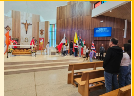
Thank you to all